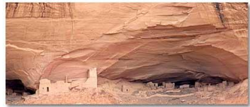
Canyon de Chelly Mummy Cave ruins

Some assignments may count as two or more quiz grades. No makeup quizzes or work completed in class will be allowed, even in cases of illness or emergency, but at least 4 quiz/short assignment grades will be dropped. Therefore the ones you miss for any reason will be the ones that get dropped. Take home assignments will be accepted late, using the penalties listed below. Assignments turned in late will be graded at my convenience.