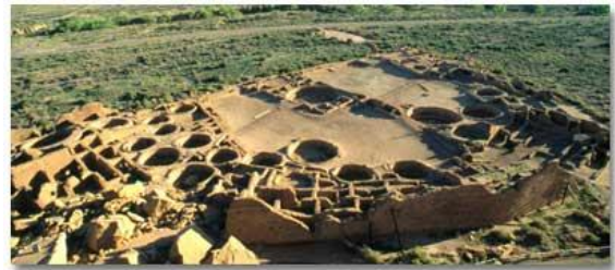
Chaco Canyon Pueblo Bonito ruins

The health and safety of our campus community is a shared responsibility of all Roadrunners. It is important to note that none of us can guarantee a COVID-19-free environment. We all must, however, follow the guidelines outlined in the UTSA Public Health Task Force Report (“Report”), and any other applicable policies as may be communicated by the University from time to time. This will include regulating behaviors outlined in the Report including face coverings, daily symptom checks and other appropriate public health behaviors associated with a shared responsibility of reducing transmission of COVID-19. Students, staff and faculty must complete a mandatory compliance training module and self-monitor for COVID-19 symptoms using the UTSA Health Self-Assessment tool before coming to campus (Refer to UTSA's Coronavirus website, the UTSA mobile app, and the LiveSafe app). In addition, students, staff and faculty must get tested if you are showing COVID-19 symptoms and communicate any COVID-19 related health concerns to your supervisor or professor. Failure to abide by these guidelines and requirements may result in disciplinary action in accordance with the student code of conduct or applicable employment policies and procedures. Violations should be reported to the Office of Institutional Compliance via the UTSA Hotline for appropriate action.